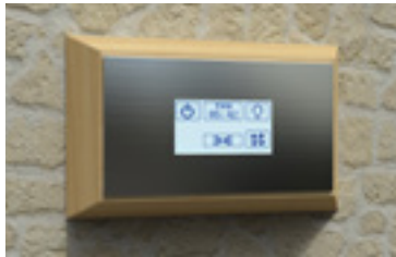
Stainless Steel Touch Control (for steam generators)