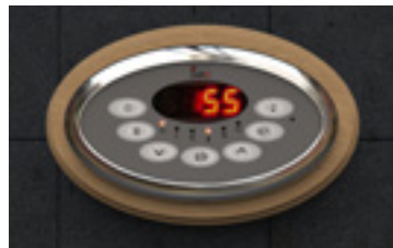
Classic Control (for steam generators)